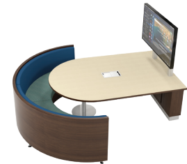
DUO-QR90L shown with Crayon Table and TV Monitor.