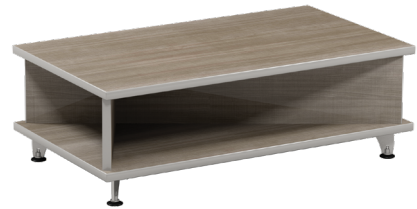
DUO-2442OT-14 Rectangle *Not available with power option