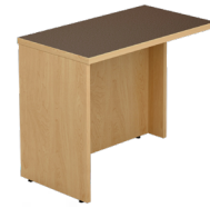
Return Left TDLR-L-C3060-29