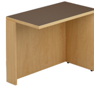
Return Right TDRR-L-C3060-29