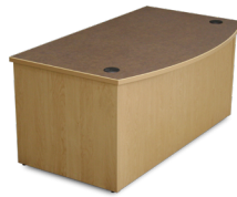
Convex Bow TDB-L-C3060-29