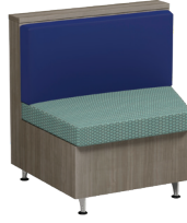
DUO-L35 Left Miter