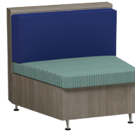
DUO-R35 Right Miter