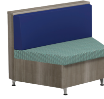
DUO-RL45 Double Miter