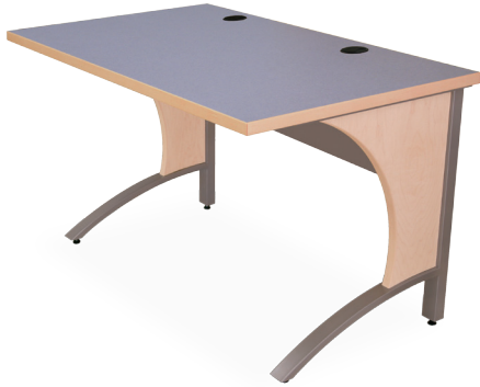
CS-E3060S shown with Steel modesty panel