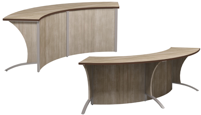
Representational image of Curved Cirrus CS-C24100-CRV-29