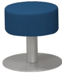
PP-17 15" Seat Dia. 15" Dia. x 17"H