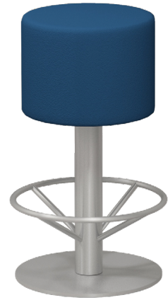
PP-30-FR 15" Seat Dia. 19"Dia. x 30"H