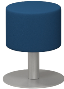
PP-20 15" Seat Dia. 15"Dia. x 20"H