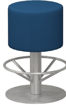
PP-25-FR 15" Seat Dia. 19"Dia. x 25"H