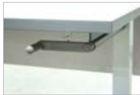
Hand Crank Detail