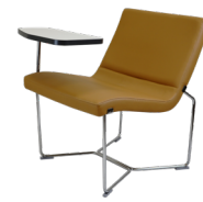
FRM-N68E13S + FRM-N68E-TABLET-R One Seater Tablet Mid Back