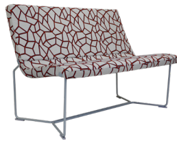
FRM-N68E03D Two Seater High Back