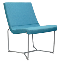
FRM-N68E03S One Seater High Back