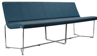
FRM-N68E13T Three Seater Mid Back