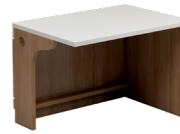
Return Unit Right DMRR-C3036L-30