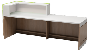
Main Unit Rear DMDL-C3096L-29