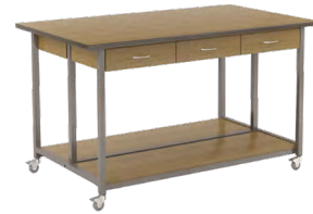
EDS-C4272-42 Shown with an ED-3SD component added to each face.