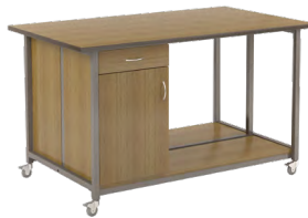
EDS-C4272-42 Shown with an EDS-SDCSL component added to each face.