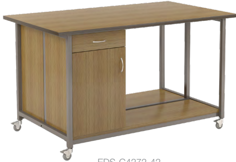
EDS-C4272-42 Shown with an EDS-SDCSL component added to each face.