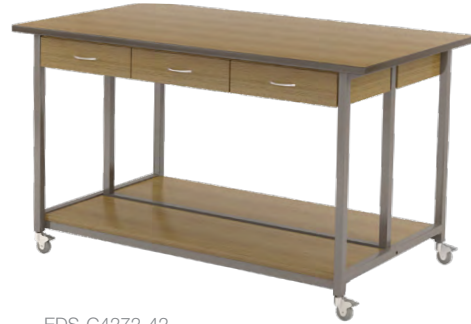
EDS-C4272-42 Shown with an ED-3SD component added to each face.