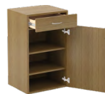
EDS-SDCLR (also available hinged left) Drawer and cupboard storage *May be added to EDS tables only.