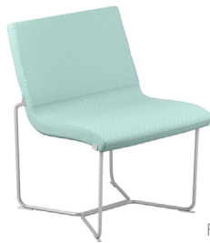
FRM-NW68E13S One Seater Mid Back